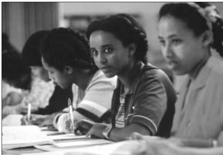
CIDA Photo: David Barbour, Ethiopia