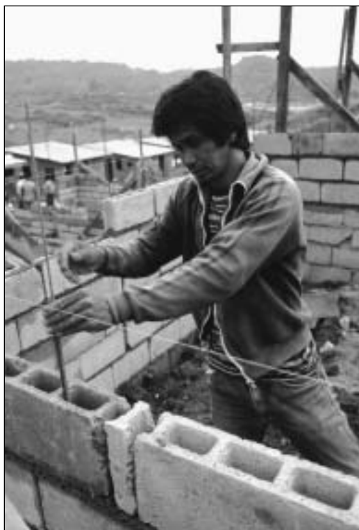
CIDA Photo: David Barbour, Philippines

Good housing conditions are often a basis for health and well-being.