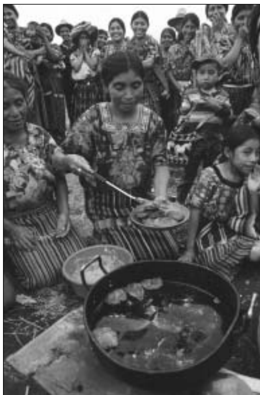
Guatemala

businesses and so on) and citizens have responsibilities in this regard as beneficiaries or agents in producing services. Experience shows that participation by individuals and groups concerned allows appropriate response to people's needs, increases the sense of ownership, and ensures the sustainability of activities. This is particularly true of the participation of women. CIDA has conducted a review of its experience and potential in this area (see Annex III: References).